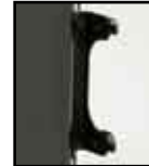
Available with adjustable hardware.