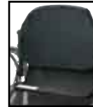
JetStream Pro™ privacy flap standard with purchase