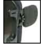
Lateral Pads available in either fixed or swing-away models.