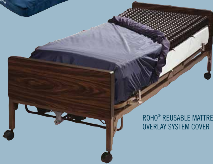
ROHO® REUSABLE MATTRESS OVERLAY SYSTEM COVER