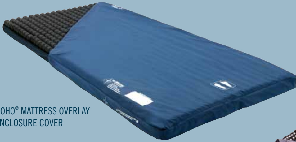
ROHO® MATTRESS OVERLAY ENCLOSURE COVER