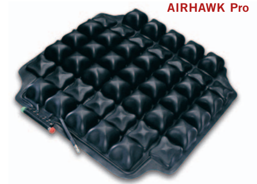
Available in Standard (19" x 19") or Wide (22" x 22")