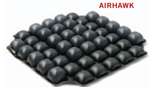
Available in Standard (19" x 19")

In other words, no more pressure points! This technology has been used since 1973 by the medical industry to treat wheelchair users and patients who are confined in bed for long periods. In fact, AIRHAWK's technology is so unique that it is currently being distributed in over 65 countries around the world.