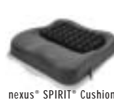
nexus® SPIRIT® Cushion