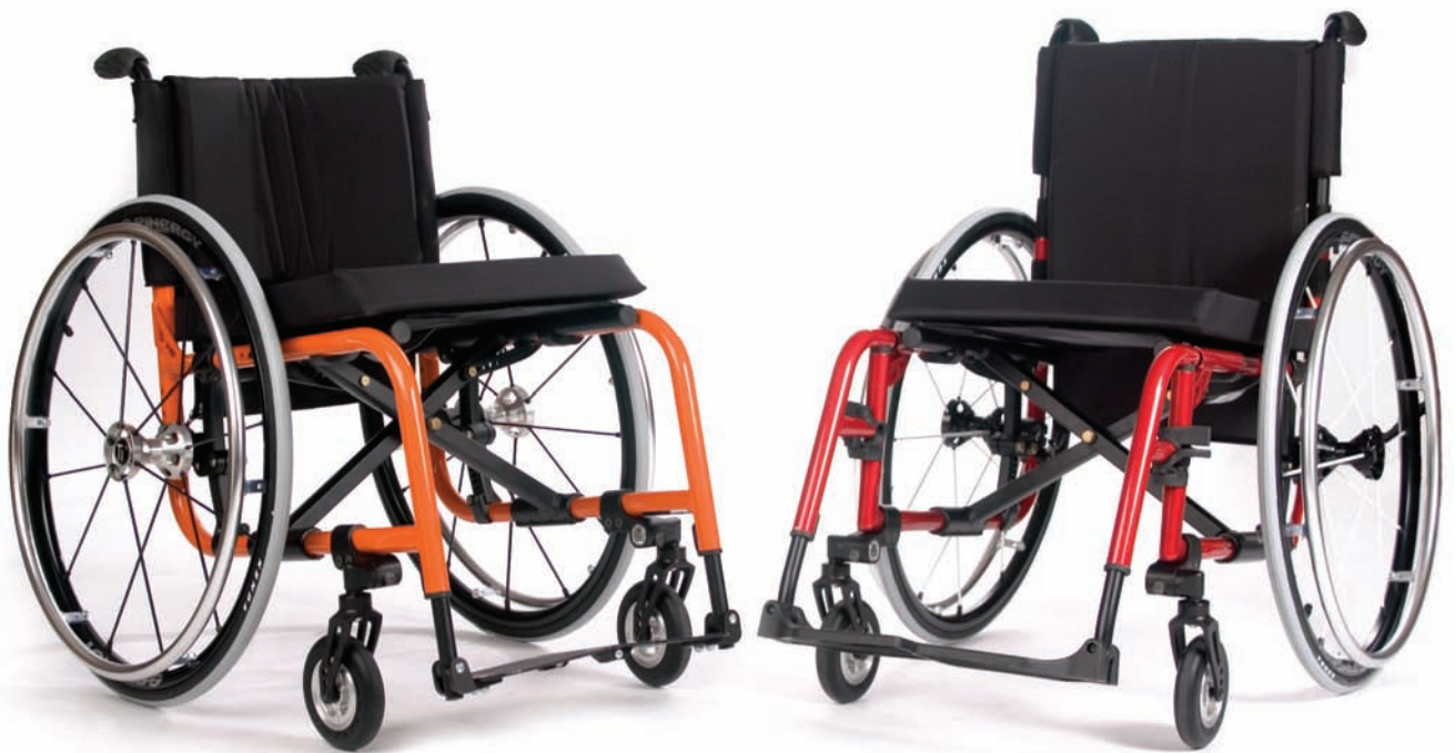
Aero X Shown with Available Options