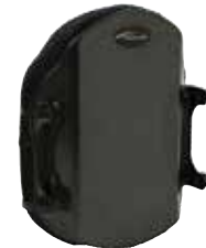
JETSTREAM PRO® BACK SUPPORT SYSTEM

FOR ADDITIONAL INFORMATION, PLEASE CONTACT: